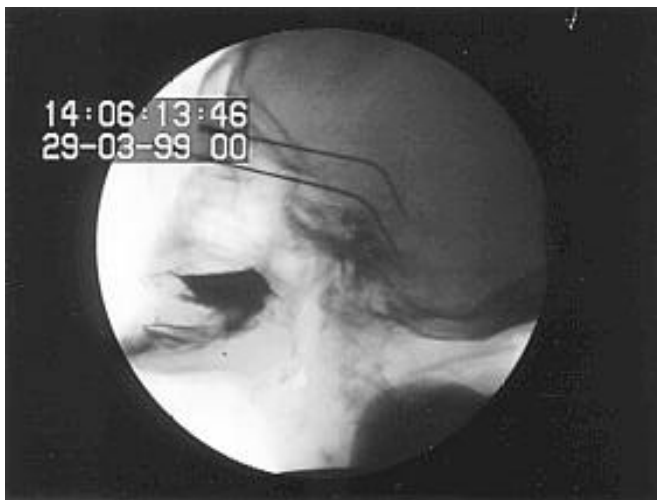
Figure 2: Sip of water (a) – Improved bolus hold in mouth. Better tongue control. (b) – During the swallow, no premature spillage, prompter swallow, and reflex triggered faster than initial study.

lingual control/tongue weakness, especially of the posterior tongue and poor pharyngeal sensation with a delayed oral phase.