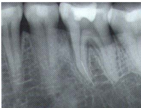
Figure 2. Broken instrument in apical one third of mesial root of a mandibular first molar.

than dentine, and AH26 are particularly difficult and often impossible to remove. Removal is thus fraught with danger and surgery may be a more sensible option in selected cases.